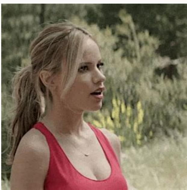
Google drive scouts guide to the zombie apocalypse in hindi.